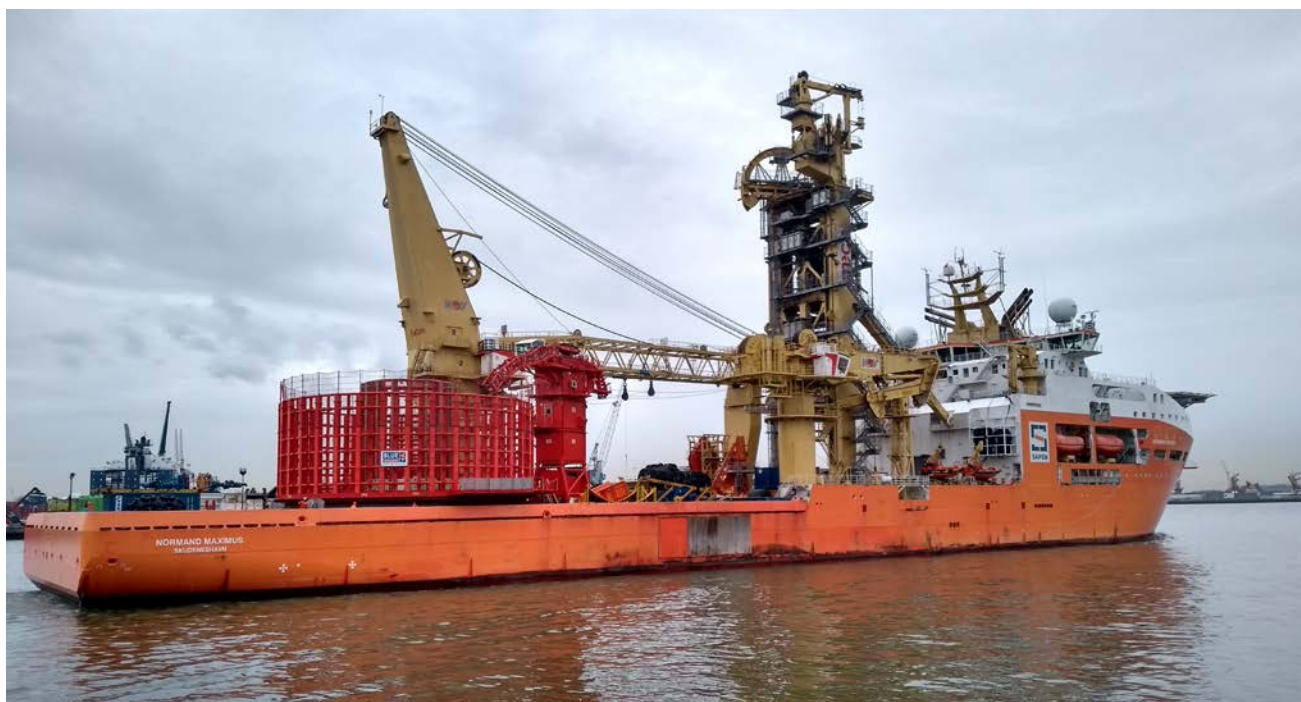
Figure 1 • Blue Offshore's BC01 on Normand Maximus.

Besides the rental equipment, Blue Offshore also provided project management, engineering and preparation of the basket carousel spread, as well as technical assistance on board Normand Maximus during transpooling operations in Norway and offshore operations in Egypt.