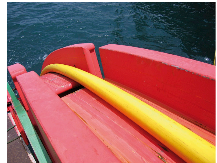
The "chute" (umbilical stinger)