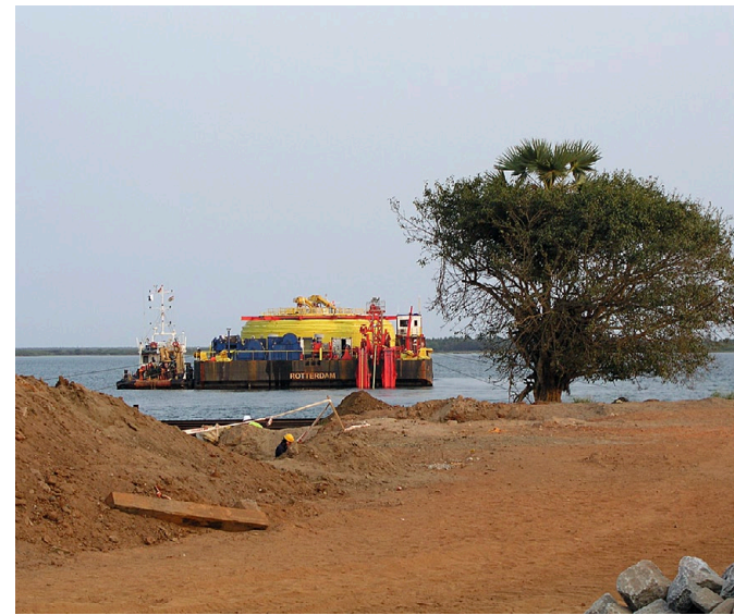
The landfall pull-in location