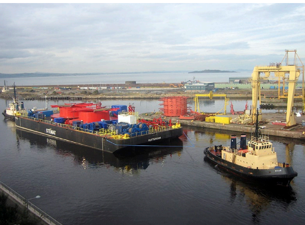
Construction of the umbilical installation barge finished in Scotland

However, before installation could commence, the lay equipment had to be manufactured and installed in Scotland, the umbilicals had to be picked up in Norway and procedures had to be prepared in the Delft office.