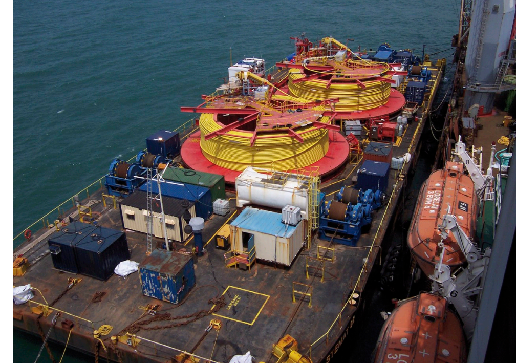
Two carousels, each spooled with 39 km umbilical

After all preparations were finalised and the Stemat 82 was towed from Norway to India, the umbilical installation could commence. The following photographs give an impression of the installation process.