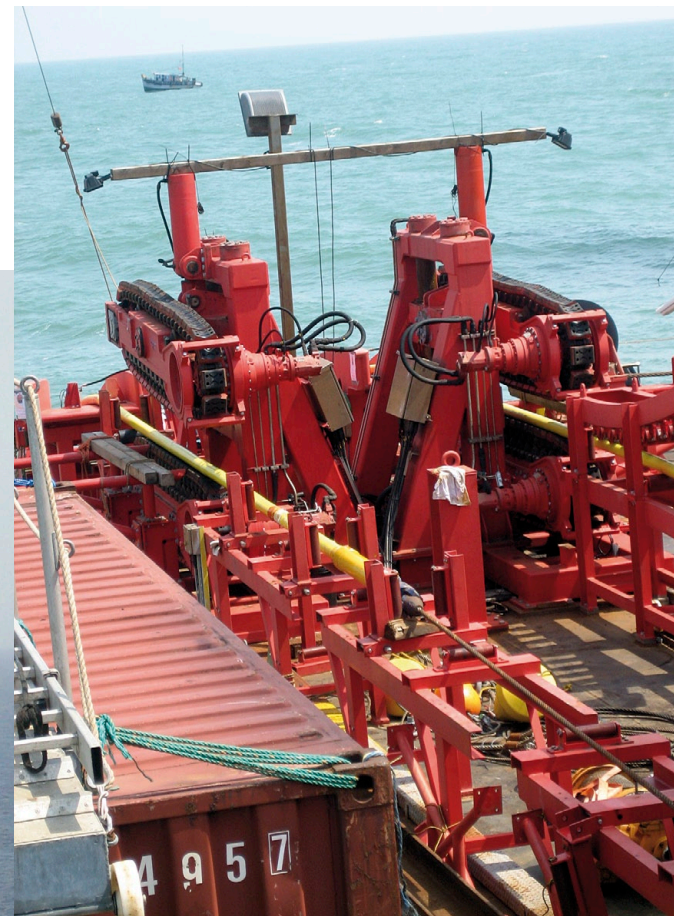
The firing line of the Stemat 82

After all preparations were finalised and the Stemat 82 was towed from Norway to India, the umbilical installation could commence. The following photographs give an impression of the installation process.